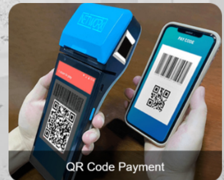
QR Code Payment