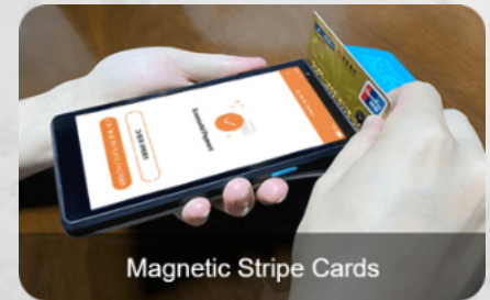
Magnetic Stripe Cards